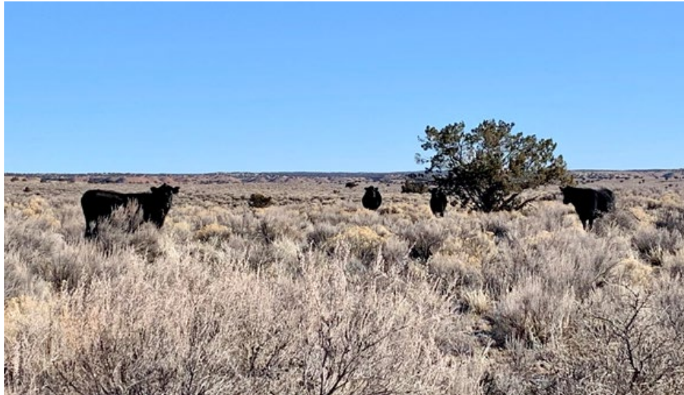
Figure 1: Cattle Grazing on the Padres Mesa Demonstration Ranch’s Sustainable Rangeland